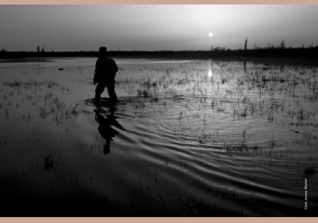
Subsistence hunter, Peter Spein, retrieves duck from small pond near Kwethluk.