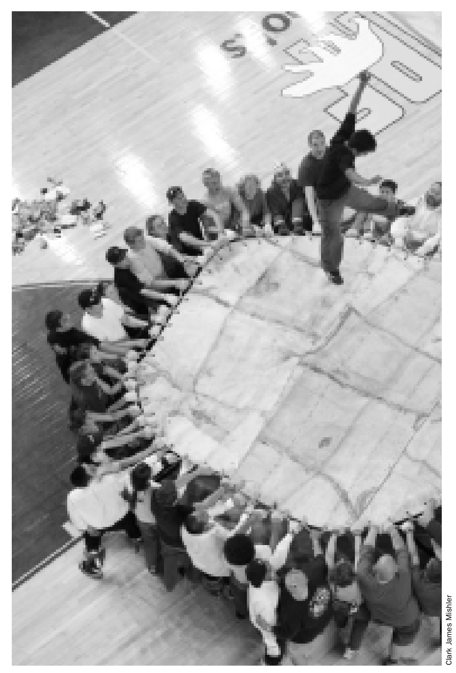
Blanket toss at the World Eskimo Olympics in Fairbanks.