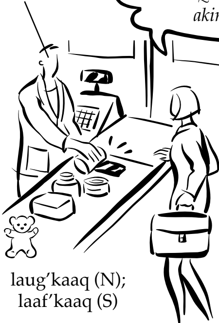
laug'kaa (N); laaf'kaa (S)