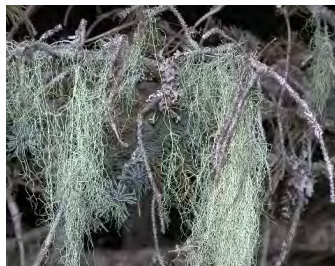
Old Man's Beard