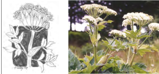
Cow Parsnip - Puchki