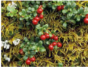
Bog (Lowbush) Cranberry