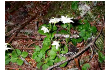
Shy maiden; Single delight